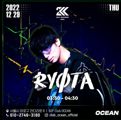
2022 in KOREA