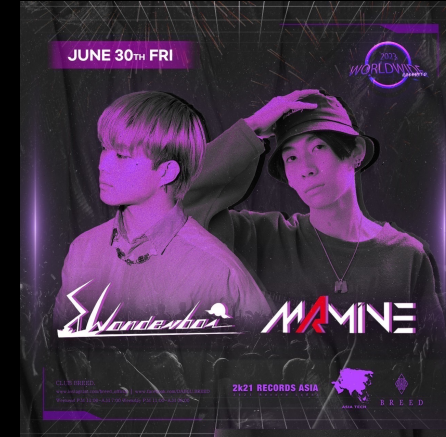
2023 in KOREA