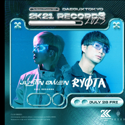
2023 in KOREA