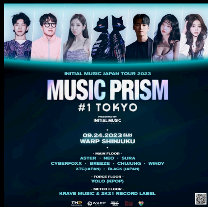
2023 0924 WARP SHINJUKU MUSIC PRISM