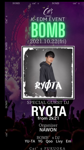
2021 in Fukuoka