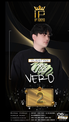
IP TOKYO 2nd anniversary