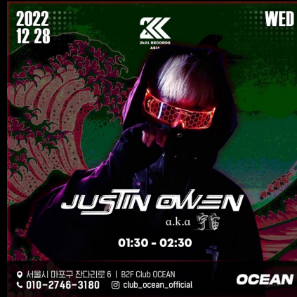
2022 in KOREA