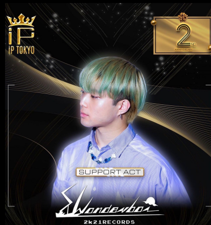
GLORY support act